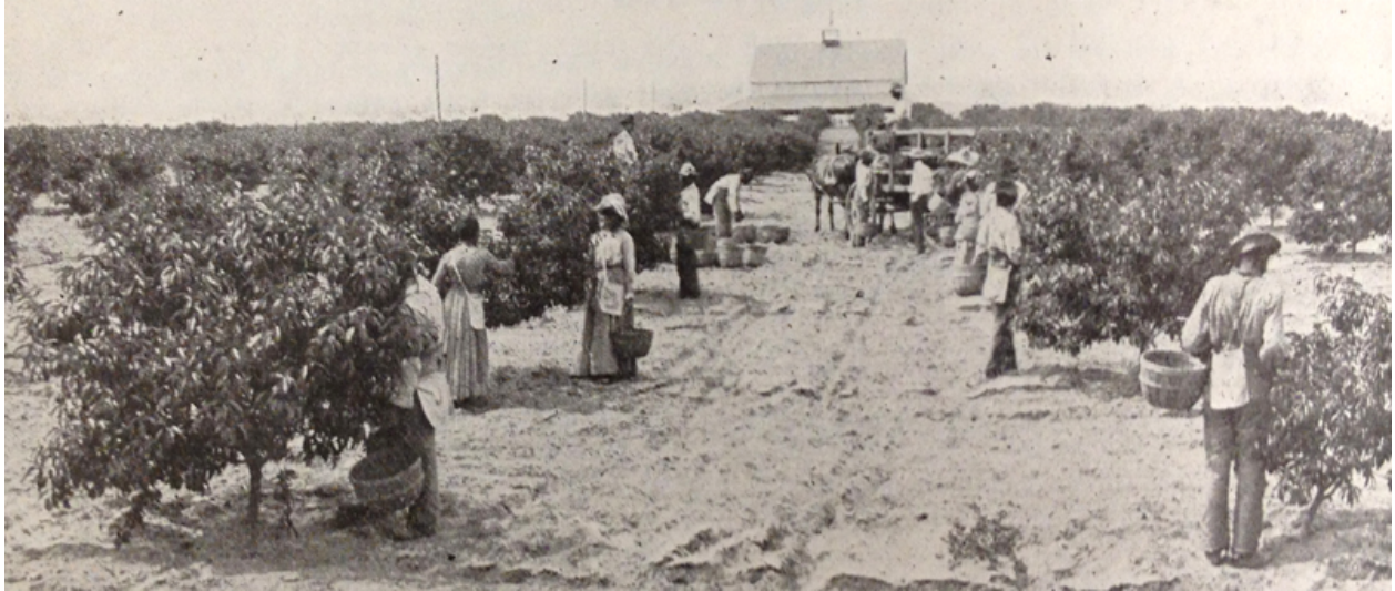
Peach trees at Fruitland in 1915 (Fruitland Catalog 1915)

“Garden Magazines” and “Gardner’s Monthly.” He was a member of the Georgia Board of Entomology, the Georgia Experiment Station and the Richmond County Agricultural Society and president of American Pomological Society for 10 years from 1887 - 1897. In 1880, the University of Georgia awarded him an honorary Master of Science degree.