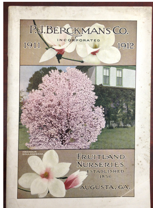
1911 Fruitland Catalogue cover with Magnolia Soulangeana grown at Fruitland Nurseries