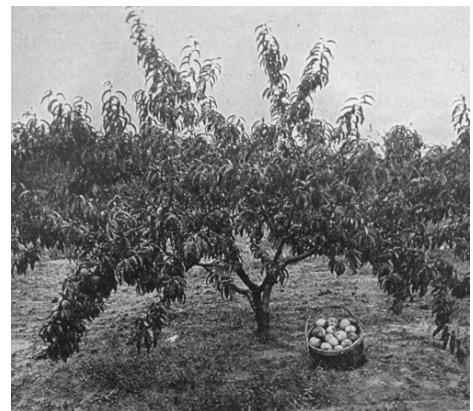
Peach tree at Fruitland

Augusta was once home to "Fruitland Nurseries" – one of the most successful horticultural sites of its time in the South. Located on Washington road, approximately 3 miles northwest of downtown Augusta, Fruitland planted millions of peach trees in the 1800s and early 1900s and made Georgia famous for its sweet Georgia Peaches.