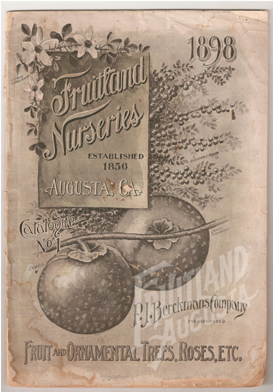
Fruitland catalog (1898)