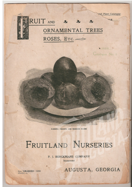
Back of 1898 catalog