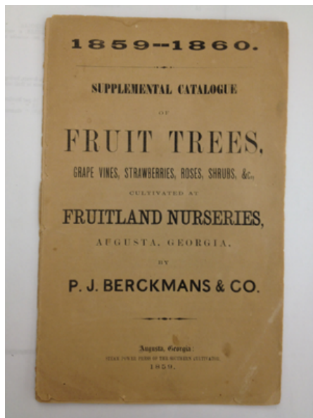
Fruitland catalog from 1859